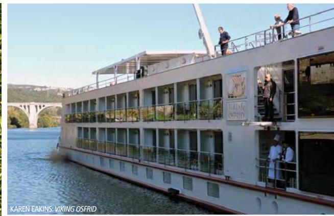
KAREN EAKINS: VIKING OSFRID