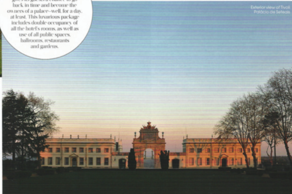
Exterior view of Tivoli Palacio de Seteais