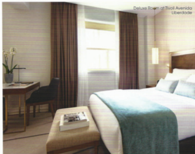
Deluxe Room at Tivoli Avenida Liberdade