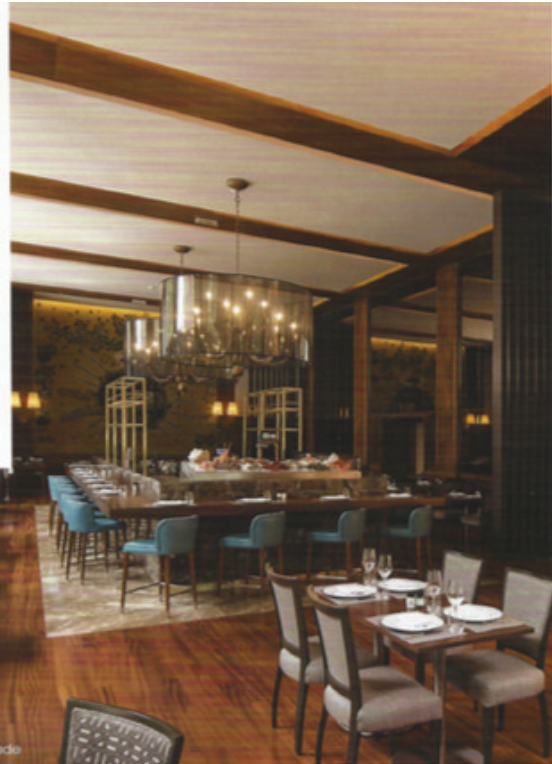
Restaurant Cervejaria Liberdade

ONCE A SUMMER HOLIDAY MAINSTAY, Portugal is quickly becoming a popular winter destination. It's one of the warmest European countries during the cold months and isn't overcrowded. Lisbon is the most obvious choice for your first landing. Replete with spectacular architecture, museums and ancient monuments, the Portuguese capital beckons art lovers, history buffs and casual travelers.