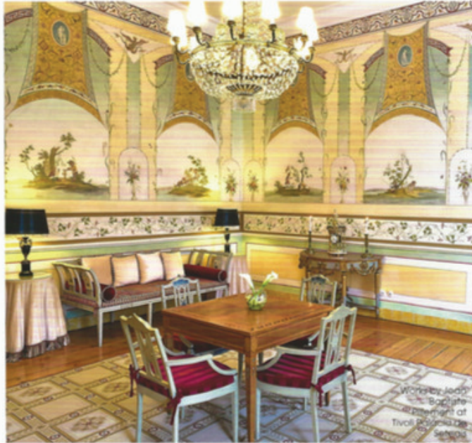
World by Jodit The complete interior of Tivoli Palacio de Seteais

How'd you like to own a palace? The Tivoli Palacio de Seteais gives its guests a chance to go back in time and become the owners of a palace—well, for a day, at least. This luxurious package includes double occupancy of all the hotel's rooms, as well as use of all public spaces, ballrooms, restaurants and gardens.