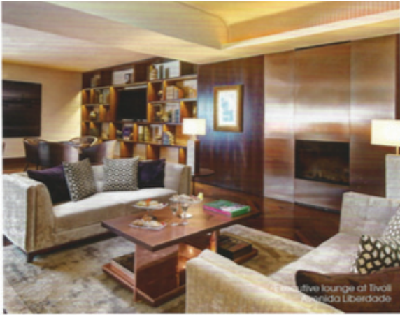
Executive lounge of Tivoli Avenida Liberdade