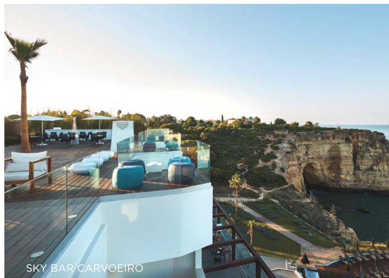
SKY BAR CARVOEIRO