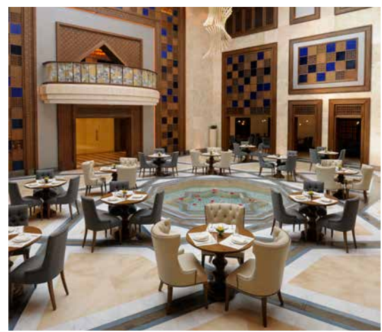
LA PIAZZA RESTAURANT