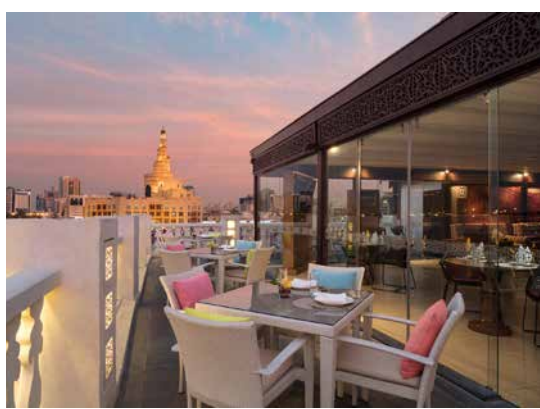
AL SHURFA ARABIC LOUNGE