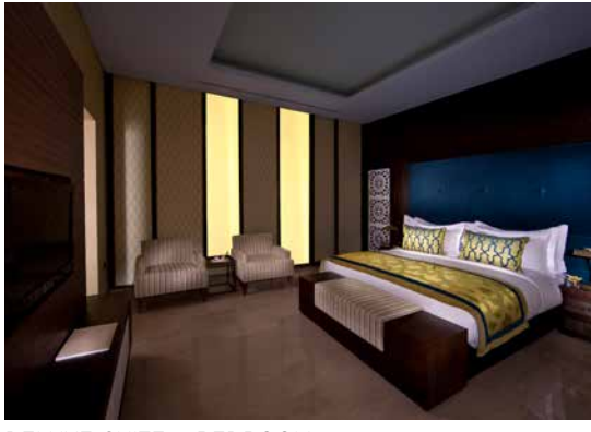
DELUXE SUITE - BEDROOM