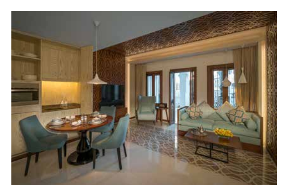
LIVING ROOM - EXECUTIVE SUITE