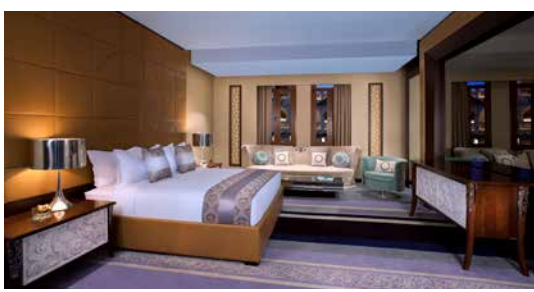
AMIRI SUITE BEDROOM