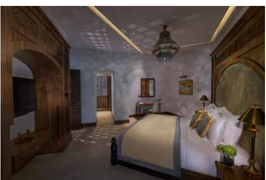
EXECUTIVE SUITE - BEDROOM