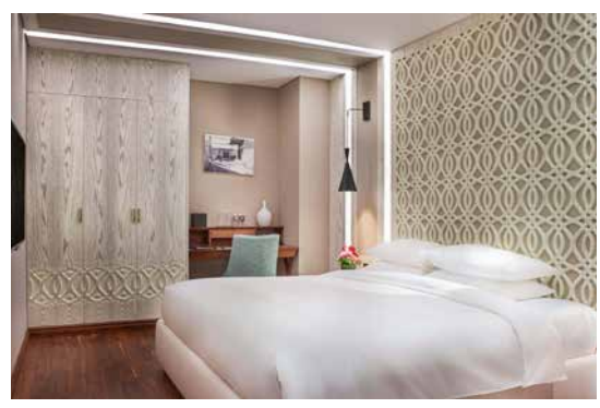
BEDROOM - EXECUTIVE SUITE